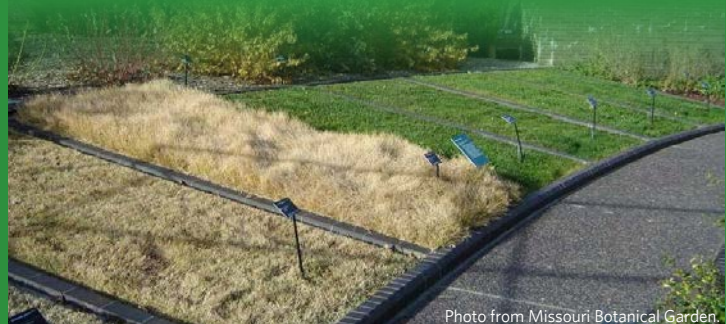
Grass plots in early November: From left warm season grasses (zoysia and buffalograss) then cool season grasses (tall fescues).

The recommended cool season alternative to Kentucky bluegrass is tall fescue, which requires less water and fertilizer. Perennial ryegrass, which germinates fast, is often mixed with Kentucky bluegrass. But ryegrass also has high watering requirements and is neither cold nor heat tolerant.