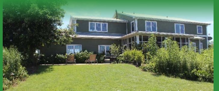
A buffalograss lawn, edged with native plants, in July in northern Illinois.

Homeowners have likely heard of the most common type of grass in the northeastern Illinois region, Kentucky bluegrass. The concern with Kentucky bluegrass is that it requires higher amounts of water and fertilizer to remain viable compared to other types of grass. Removing some, or all, of the Kentucky bluegrass from your landscape and installing an alternative grass species can save water and protect water quality. Additionally, consider shrinking your lawn by edging with native plants.