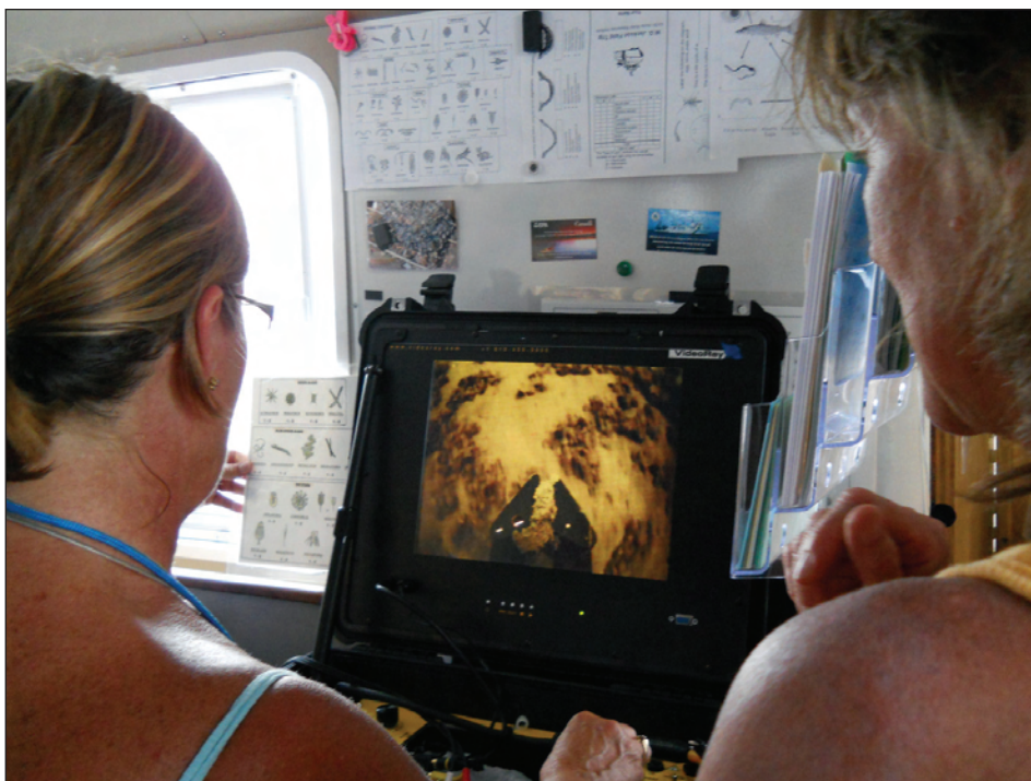
Workshop participants learn how to operate an ROV (remotely operated vehicle) aboard the W.G. Jackson.

Those aboard the U.S. EPA's R/V Lake Guardian for the CO-SEE Great Lakes Shipboard and Shoreline Science workshop got a lock, stock, and barrel experience of Lake Michigan, the last stop for the Great Lakes workshop series.