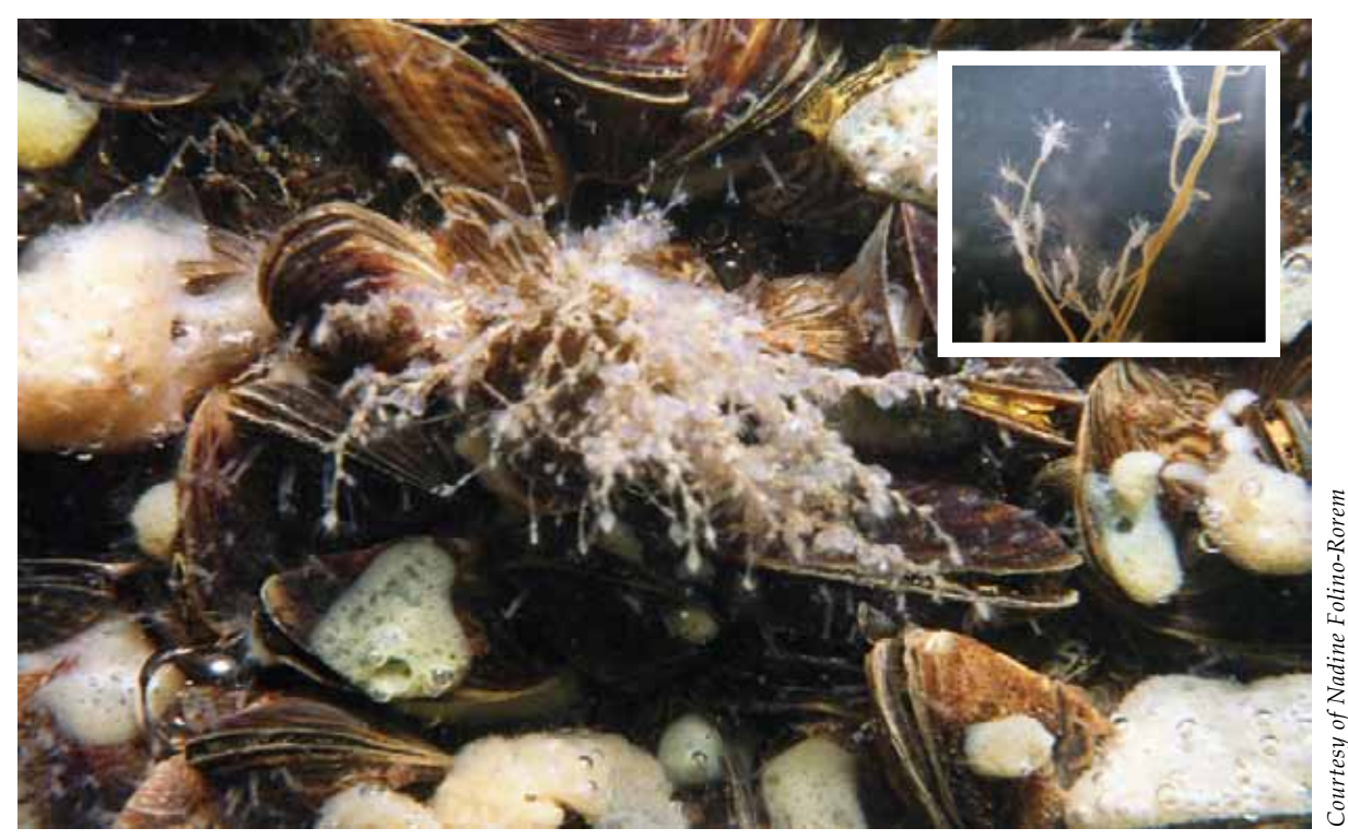
C. caspia colonizes on hard surfaces, such as the shells of quagga mussels.

the recent spread of quagga mussels may increase the amount of available substrate for attachment. Unlike zebra mussels, quagga mussels can colonize the soft, muddy bottoms found in deeper areas. According to Tom Nalepa, a NOAA biologist at the Great Lakes Environmental Research Laboratory, 99 percent of what his team finds when sampling offshore in southern Lake Michigan waters is quagga mussels.