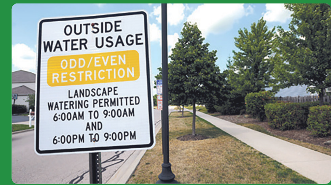
A sign displaying water restrictions posted in Huntley Illinois during the drought of 2012. Adoption of uniform watering restrictions among NWPA communities could go a long way toward protecting water supply.

The Northwest Water Planning Alliance is doing its part to promote water conservation by encouraging member communities to adopt a regional, year-round lawn watering ordinance with drought provisions to protect our shared water supplies. You can do your part to save water and money by adopting these conservation practices.