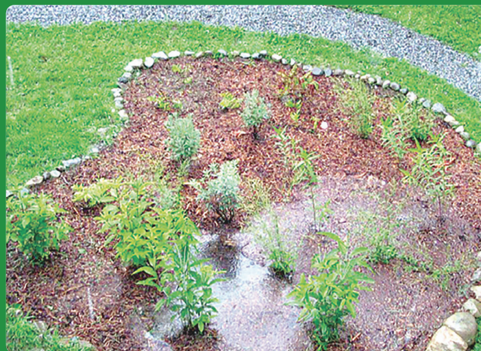
A residential property rain garden during a 4-inch storm.