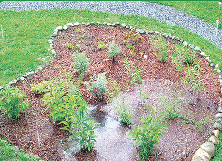
A residential property rain garden during a 4-inch storm.