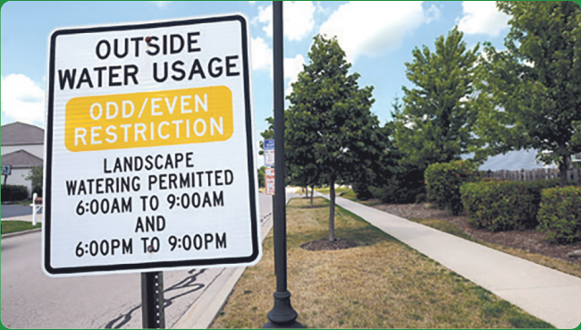
A sign displaying water restrictions posted in Huntley Illinois during the drought of 2012. Adoption of uniform watering restrictions among NWPA communities could go a long way toward protecting water supply.

The Northwest Water Planning Alliance is doing its part to promote water conservation by encouraging member communities to adopt a regional, year-round lawn watering ordinance with drought provisions to protect our shared water supplies. You can do your part to save water and money by adopting these conservation practices.